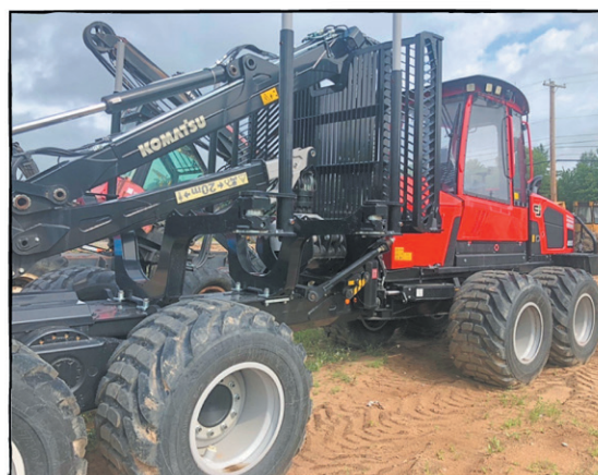
UNIT L3118 - 2021 KOMATSU XF855-2 FORWARDER