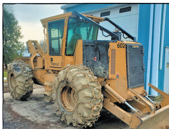
UNIT L3073 - 2019 TIGERCAT 602 SKIDDER