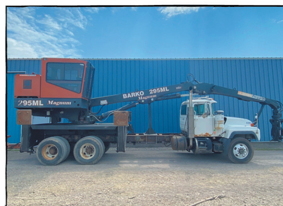
UNIT L3140 - BARKO 295ML LOADER, MOUNTED ON A 2001 MAC TRUCK WITH A CTR BAR SAW SLASHER AND NEW 4642 ROTOBEC GRAPPLE