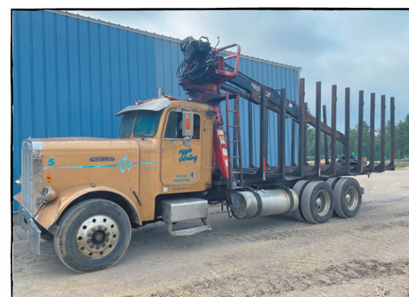
UNIT L3151 - PRENTICE 120 LOADER MOUNTED ON A 1986 FREIGHTLINER

Serving Forestry Professionals Since 1981