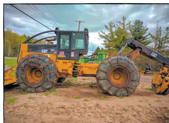
UNIT L2453 - 2010 CATERPILLAR 545C