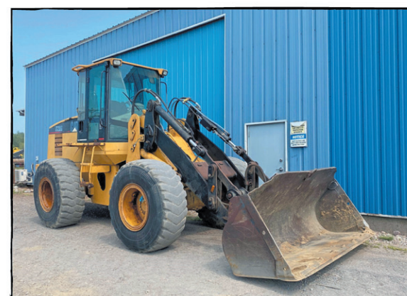
UNIT L3156 - 2000 CAT IT28G LOADER