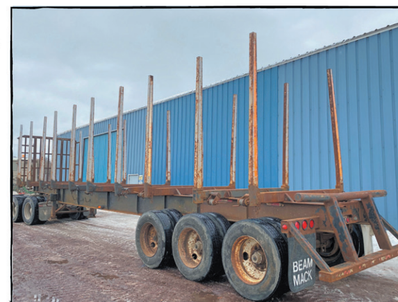
CONSIGNMENT UNIT - 2004 PITTS LT45-UL 45' TRI-AXLE LOG TRAILER