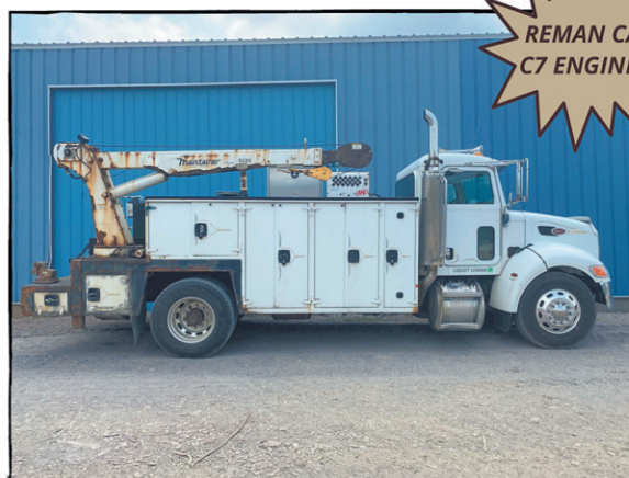
UNIT CJTK20 - 2005 PETERBILT 335 TRUCK WITH MAINTAINER BODY