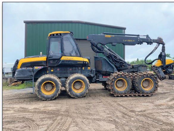
Unit L3072 – 2015 Ponsse Ergo Harvester