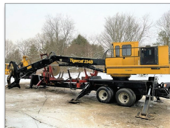
Unit 3263 – 2015 Tigercat 234B Loader on Pitts Carrier, CSI 264 NTS Delimber and ProPac 60" Slasher