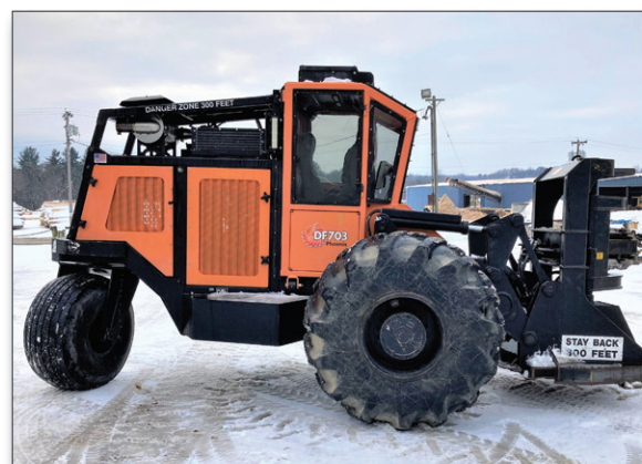
Consignment Unit – 2019 Delfab with 18' hot saw and Seppi MT175 Head 649 hours