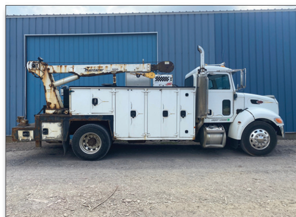
Unit CJTK20 – 2005 Peterbilt 335 Truck with Maintainer Body