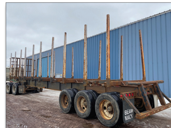
Consignment Unit – 2004 Pitts LT45-UL 45' Tri-Axle Log Trailer

Serving Forestry Professionals Since 1981