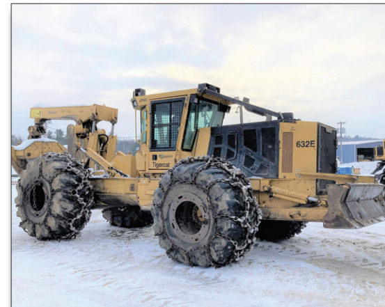
Unit L3239 – Used 2017 Tigercat 632E with 7628 hours