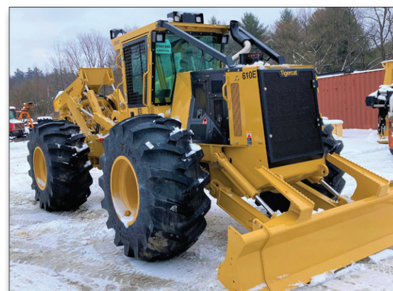
Unit L3202 – 2022 Tigercat 610E