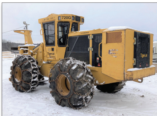
Consignment Unit – 2017 Tigercat 720G Feller Buncher