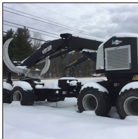
2005 Timberpro 830F Forwarder with Clam Bunk attachment and Rotobec 5052 Grapple