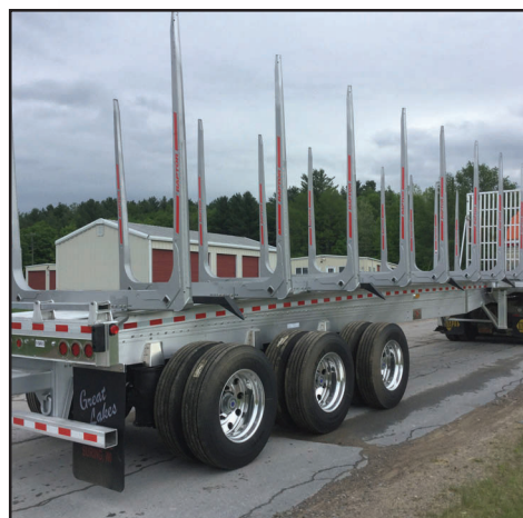
2020 Great Lakes Aluminum Triaxle Log Trailer