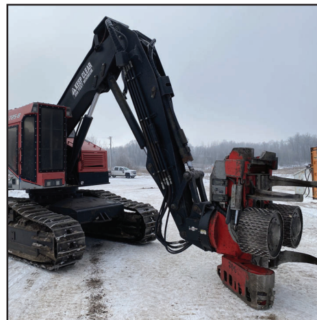
13 TimberPro Harvester with Log Max 7000xt, 5151 hours

Come Join Our Team at CJ Logging We're Hiring!