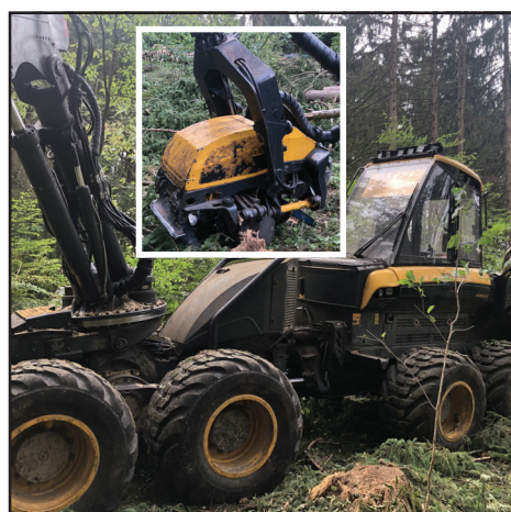
2015 Ponsse ERGO Harvester