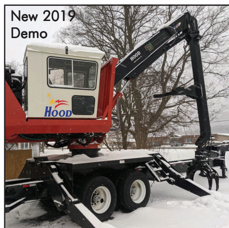
New 2019 Demo Hood S 182 Log Loader with Tier 3 Engine on Pitts Trailer with Rotobec 4642 Grapple, 6.3 hours