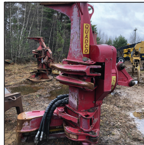
17 Quadco 3200 Head with 1617 hours