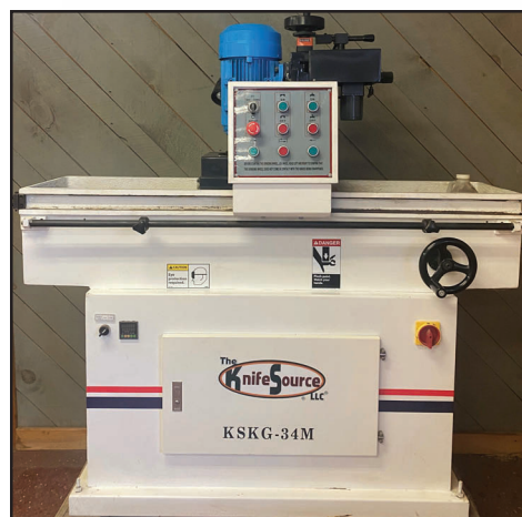
New Knifesource Knife Grinder – KSKG-34M