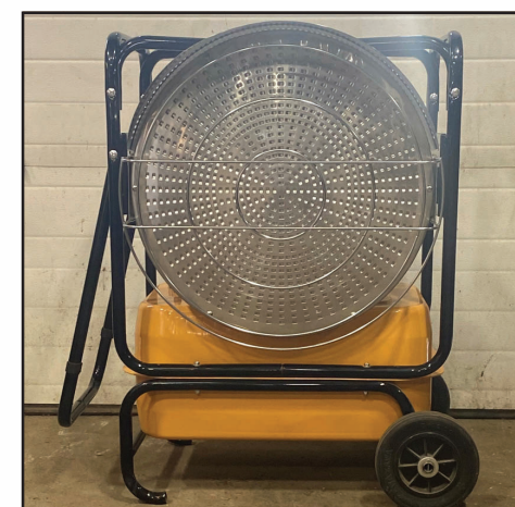
Val 6 Infrared Space Heater – KBE5L

Serving Forestry Professionals Since 1981