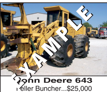
John Deere 643 eller Buncher...$25,000