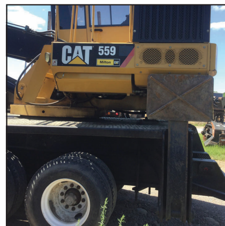
2013 Caterpillar 559 Log Loader