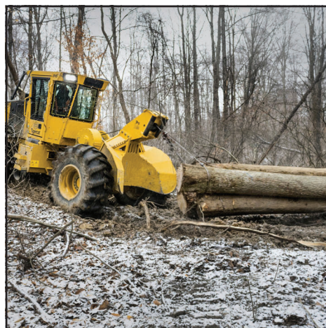
2019 Tigercat – 602 Cable Skidder Ring & Ice Chains, 1130 hours