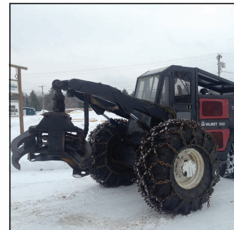
1997 Valmet 503-3 Wheeled Feller Buncher with Dangle Head