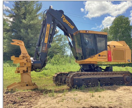
L2787 Tigercat Feller Buncher LX870C 7,370 hours