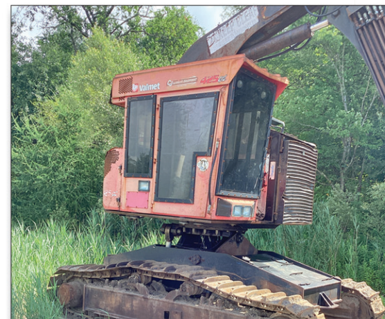
L2631 Timbco 425EXL 14,713 hours

Serving Forestry Professionals Since 1981