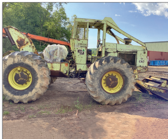
L3233 Treefarmer C5D