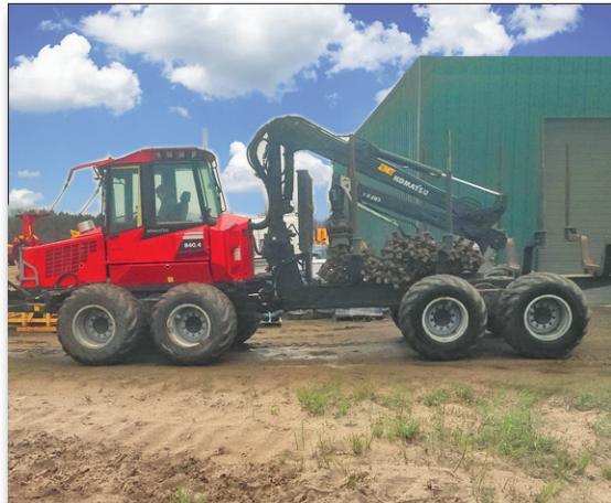
L2936 Komatsu 840.4 10,005 hours