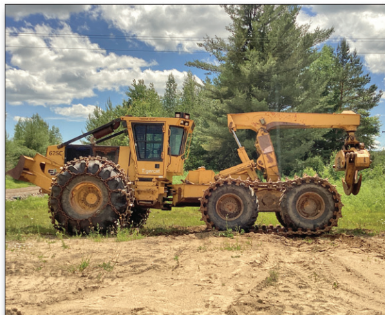
L2797 Tigercat 625C Skidder 13,802 hours