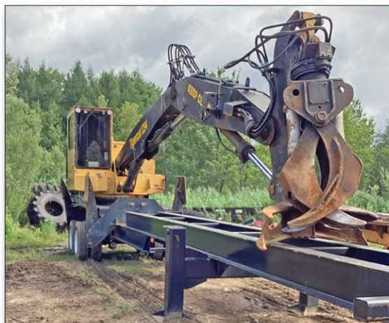
L2674 Tigercat 234 18,342 hours