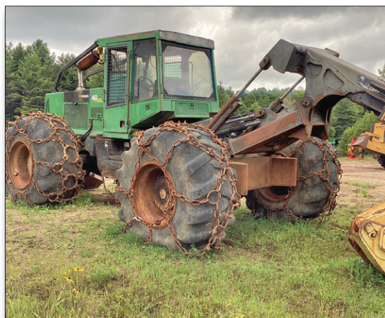
L2736 Timberjack 460 11,848 hours