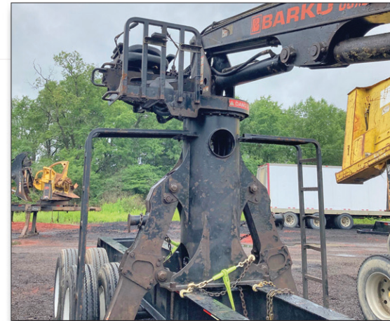
L3340 Barko 80 XLE Loader no grapple