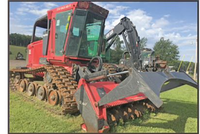
2009 RISLEY ECLIPS EX300 w/ mulching head. 300hp Cummins, high speed FlexTrac (6 mph). . . . . CALL