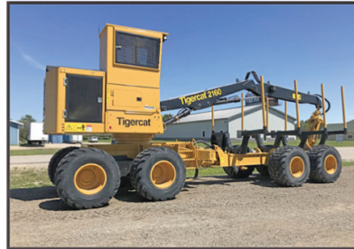
2019 TIGERCAT 2160 Rugged, powerful loader-forwarder well suited to mill yard, 30T payload . . . . . CALL