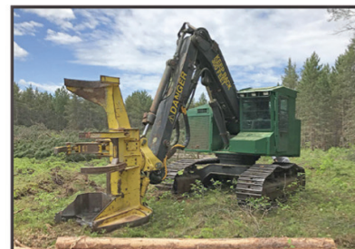
2002 TIMBERJACK 608B Stk#U1030. 11,640 hrs. FS20 hotsaw head. Used every day until new Tigercat . . . CALL