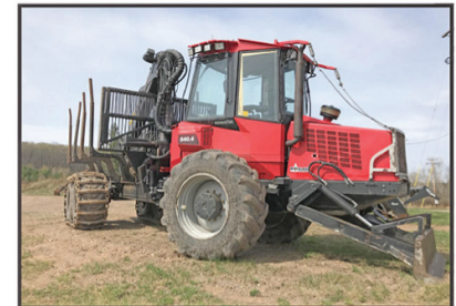
2012 KOMATSU 840.4 9,815 hrs, One owner/operator and well maintained - synthetic oil . . . . . CALL