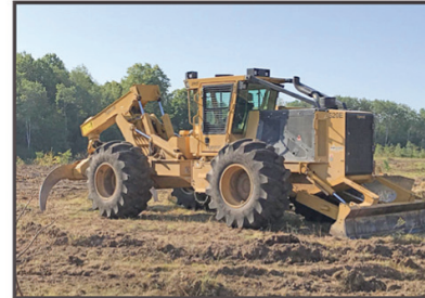
2018 TIGERCAT 620E 870 hrs. Less than 1000 hours, Customer expanding cut-to-length operation. . . . . CALL