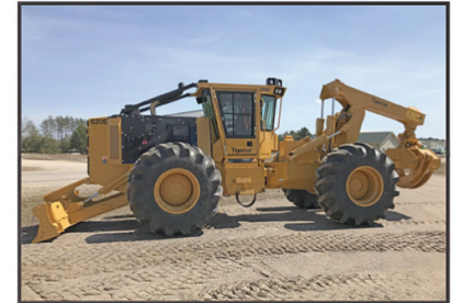
2019 TIGERCAT 620E 221hp, 4WD, EHS transmission for speed and full tractive effort. 17'sq grpl. . . . . CALL