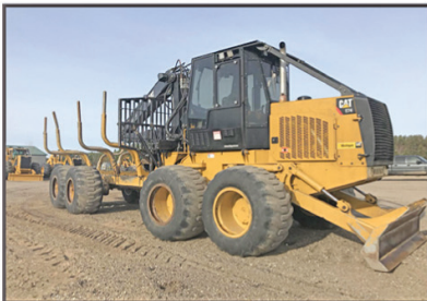
2015 CAT 574 7,040 hrs, 8wd, 16 ton, electric power shift trans, Cat squirt boom, Hultdins 360S grapple . . CALL