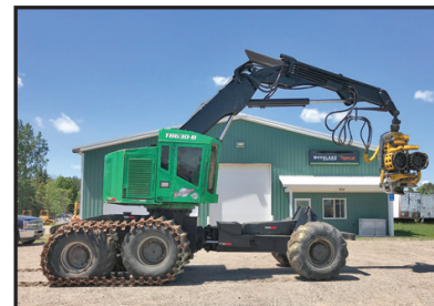
2006 TIMBERPRO TB630B Stk# U994, 10,600 hrs., NEW Kesla RH30-II harvesting head . . . . . $285,000