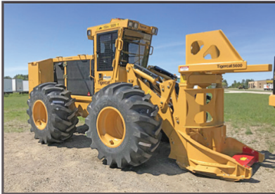
2019 TIGERCAT 724G Stk# N2455, S/N: 7244404, Tigercat 5600 Bunching Head . . . . . CALL