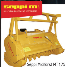
Seppi Midiforst MT 175

DF703's hydraulic system can easily connect to a number of attachments - including Seppi mulching heads.