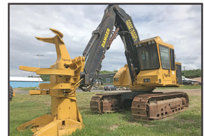
01' TIGERCAT 845B W/ Tigercat 5700 hotsaw. Turbo just replaced. Saw has recent disc/spindle asseby . . . $79,000

Family Owned for 45 Years - Woodland Computer System for CTL Shop and Field Service - Stocked Parts