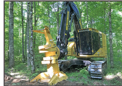
2020 TIGERCAT X822D 282 hp, with Tigercat 5702 23" Disc Felling Head. Powerful, stable, built for durability.