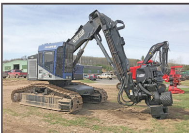
12' TIMBERPRO TN725B 8,159 hrs, with REBUILT Risley Rolly R24B Barsaw Harvesting Head. . . . . CALL