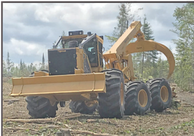
2019 TIGERCAT 625E 221 HP, 6WD. NEW Bogie Grapple Skidder. Excellent for soft terrain. . . . . CALL