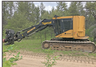
2014 TIGERCAT 822C 5,907 hrs, Woodland Rolly Rebuild and new Woodland Computer System. . . CALL