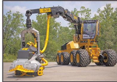
2019 TIGERCAT 1165 Wheeled harvester! Featured with Kesla 29RH-II harvesting head. . . . . CALL