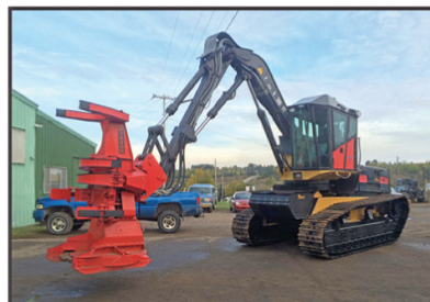
2006 RISLEY ECLIPS EZ200 3,500 hrs, Versatile machine, suitable for a wide variety of heads and uses. CALL